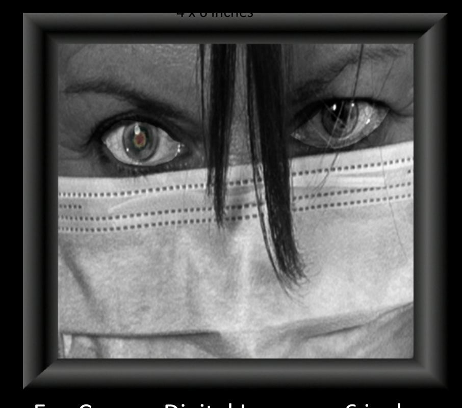
Eye Corona Digital Image x 6 inches

As a photographer I wanted to add to the In-Isolation exhibit for a few reasons. Mostly just to document something from this pandemic period in my own way. Also, to express and share something about how it might be affecting others. Originally, the inspiration was to highlight the effect of isolation on the elderly who are already within a stage of isolation, in age and living remotely with little connection and understanding as they approach the 'end' so to speak. I wanted to connect this aspect of their isolation and the current situation affecting all of us now.