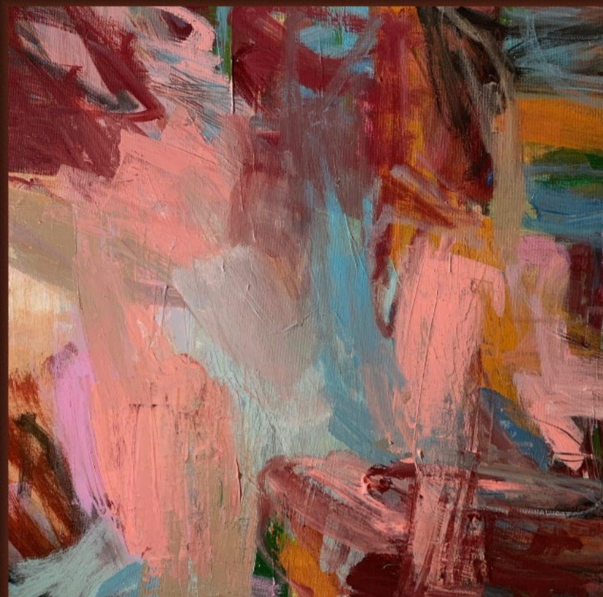
STORM ANATOMY 50 x509 Mixed media on Canvas

Isolation meant escaping into new values through the study of new methods of mark marking.